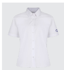
Twin Pack Shirt or Blouses