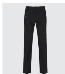
Trousers or Skirt